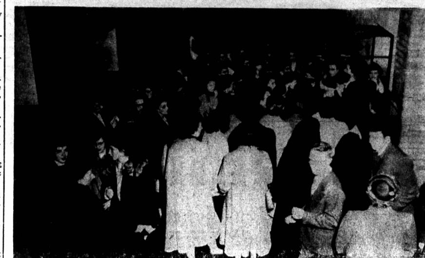
Group of teachers gathering at one of the rooms at Prince of Wales College yesterday to attend a discussion meeting during convention.