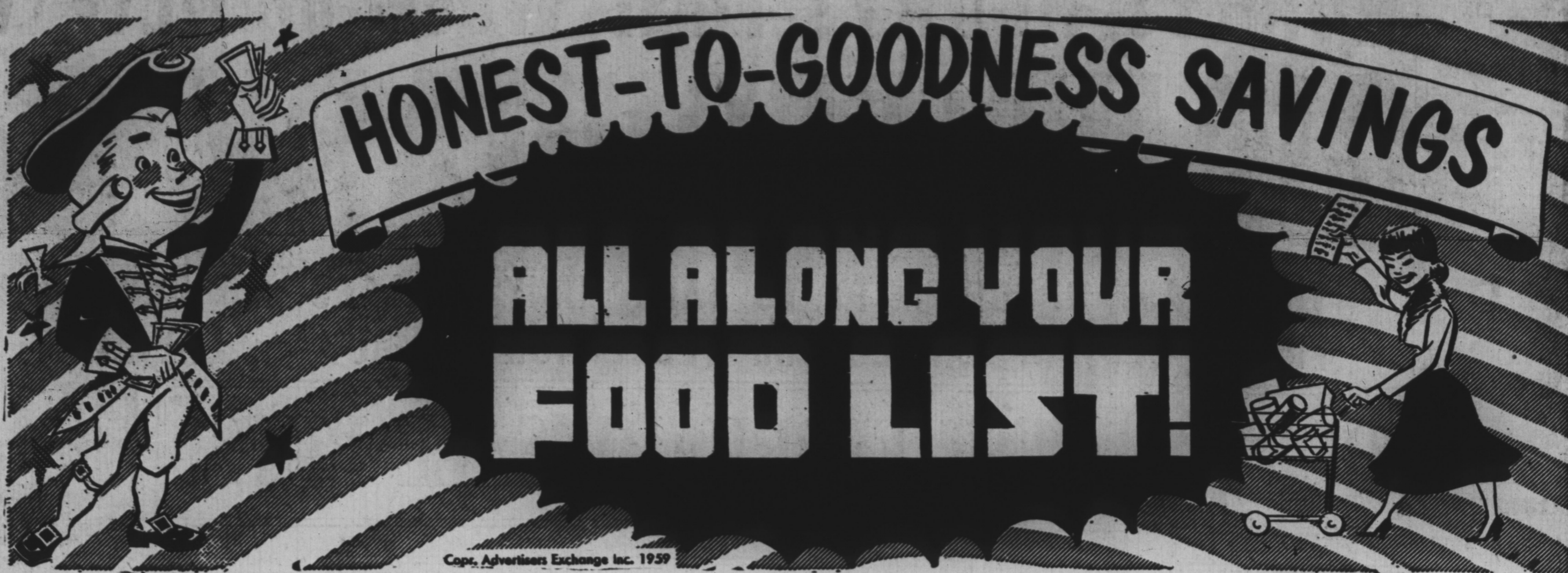
Copy, Advertiser Exchange Inc. 1959

BLADE—WITH BLADE REMOVED ROAST BEEF . . . lb. 69c DEVON RINDLESS—FACTORY SLICED BACON . . . 1 lb. cello 57c LEGS AND BREAST CHICKEN . . . . . lb. 49c