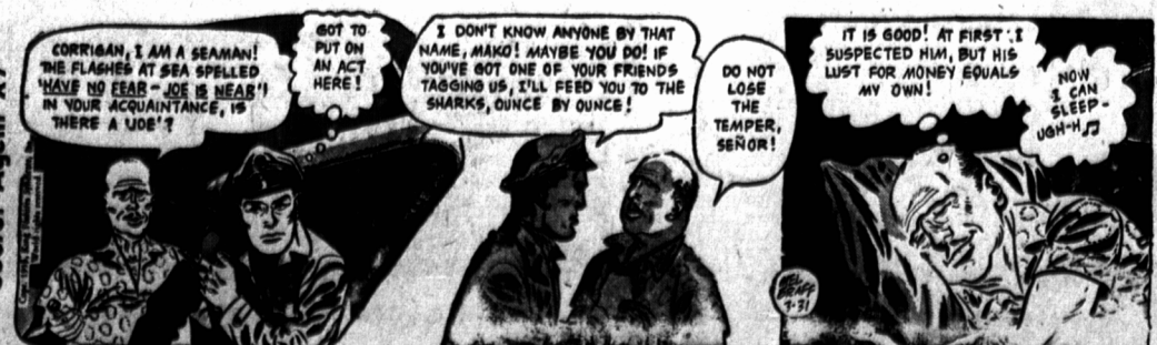
Secret Agent X9