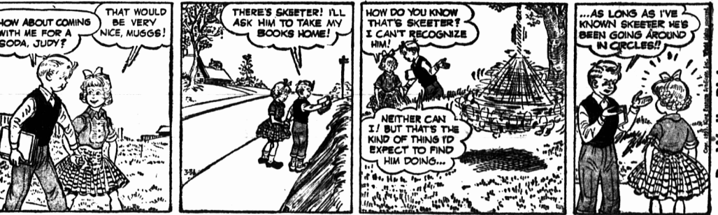
Mugs and Skeeter