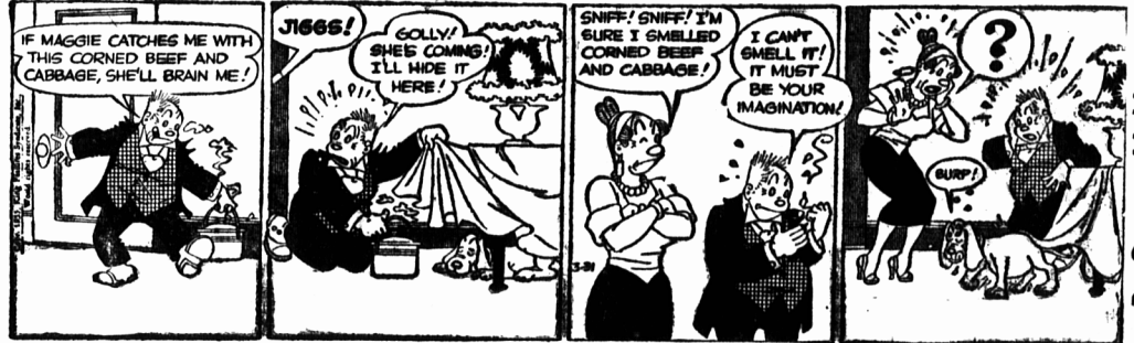
Bringing Up Father