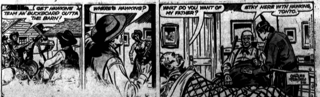
The Lone Ranger