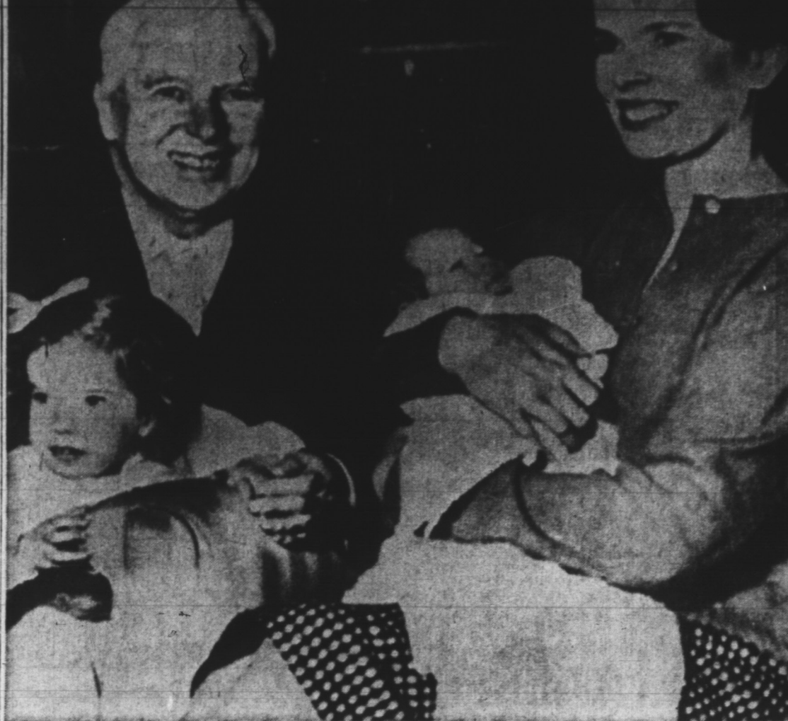
LATEST ADDITION TO CHAPLAINS