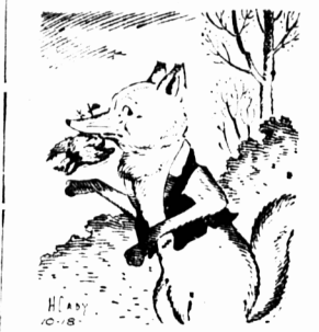
Then he had found one of Bob White's flock who had been killed.

dogs to help them. But now they were out for Thunderer the Grouse and Bob White and Longbill the Woodcock. As long as Reddy kept out of range of the guns, and out of sight, there was nothing for him