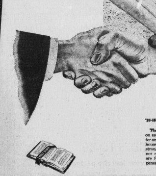
"THE CHURCH FOR ALL... ALL FOR THE CHURCH"

FOR TOMORROW Pioneers are as plentiful today as ever... indeed, in this world of ever-new frontiers, you too, are a pioneer. As such, you bear great responsibility. For defined, "a pioneer is one who goes before, preparing the way for others to follow." The Church reaches out to you in greatest urgency. It needs you to help, by example and precept, combat the greed and intolerance that today threaten our world. The Church needs you as another pioneer in Christian example and thinking. You can help prepare the way for others by promoting generosity, kindness, and love toward all other human beings. Through the Church you can, as a pioneer, strive most effectively toward generous, tolerant, tomorrow for your fellowman.