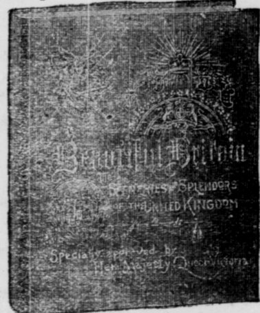
Large quarto volume (11 1/2 x 13 1/2 ins.), 325 pages. Extra enameled paper. Extra English cloth, embossed in gold.

A magnificent collection of views, with elaborate descriptions and many interesting historical notes. Text set within ornate borders, printed in a tint. A fine example of up-to-date printing.