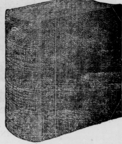
Weight nearly 12 lbs. Size 8 1/2 x 10 1/2 x 1 inches. Full Sheep or Half Russia. With Dennison's Patent Index 35c. extra.

EVERY HOME MUST HAVE A DICTIONARY. The Make-up of this edition is superior, the clear white paper, and strong, heavy, durable binding, being in marked contrast to the dirty, brittle wood-pulp paper and flimsy binding of the cheaper editions heretofore published.