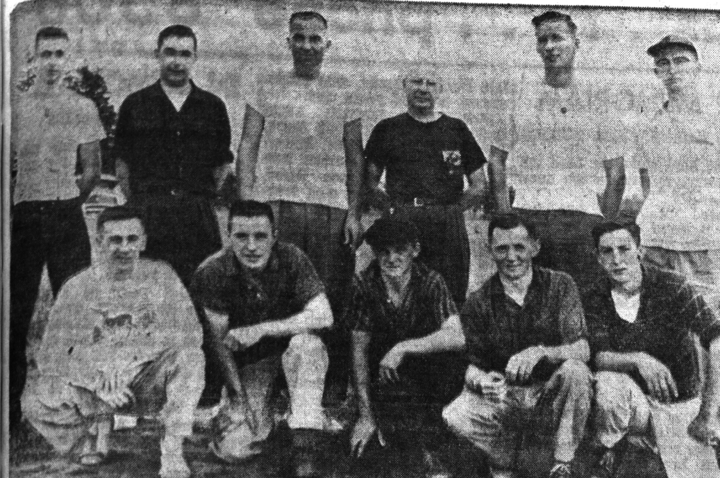
MONTAGUE SOFTBALL NINE

*Patented Product trademark for sulfonated hydrocarbon surfactants. CANADA'S LARGEST SELLING DEODORANT