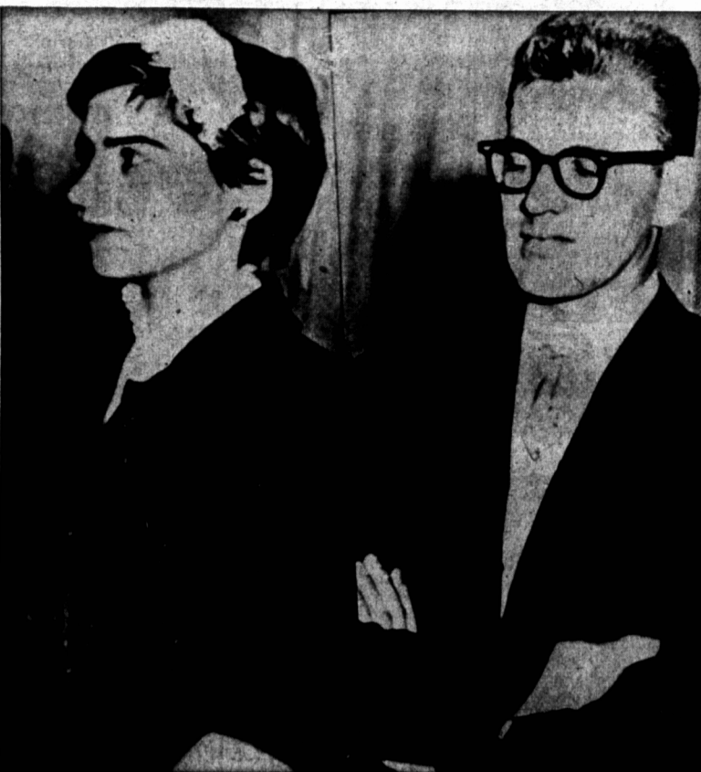
QUINT TO WED

UNITED NATIONS N.Y. (AP) Syria told the United Nations Tuesday night that Turkey is threatening peace by massing troops on the Syrian border.