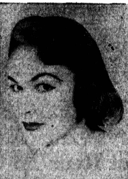
For Normal Hair