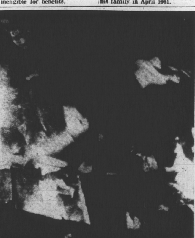
Witnesses of a Montreal art experiment gathered around a barrel of molten metal in a barrel to produce a spontaneous form. The hot barrel exploded, injuring nine witnesses and igniting materials in the basement of a nearby factory. The fire was quickly extinguished.