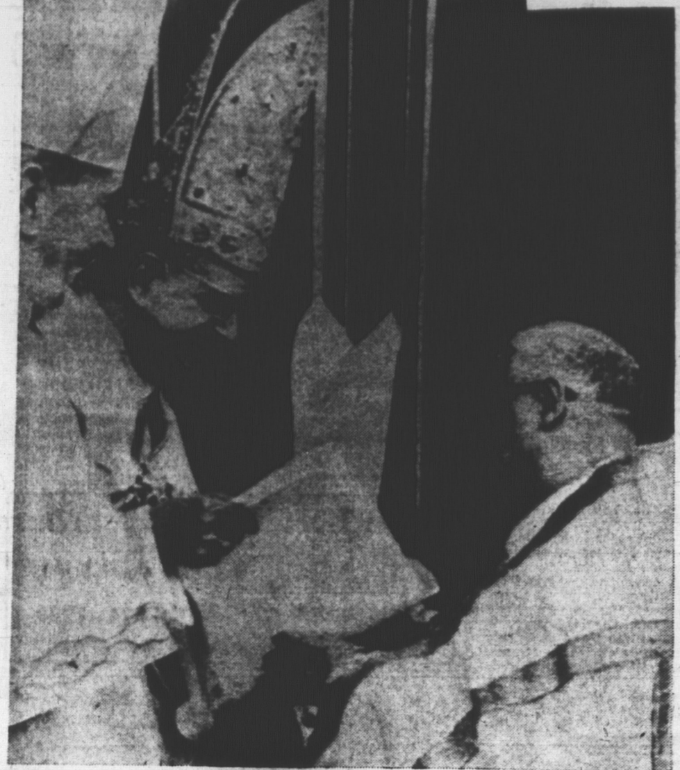
POPE PAUL VI receives the Apostolic brief, announcing that the Vatican Ecumenical Council is formally closed, from Archbishop Pericle Felici, secretary of the council, after it was read at the outdoor ceremonies in Vatican City's St. Peter's Square Wednesday. The council had been opened three years ago by Pope John XXIII.