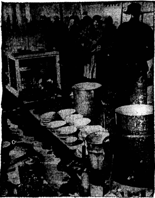
SHOPPING IN POLAND —This sidewalk market scene in Lemberg, Poland, is typical of many cities now behind the Iron Curtain. Lemberg, once a fairly prosperous city, was absorbed by Russia during the war. Most Lemberg Poles were evacuated westward to Polish territory and replaced by Russians. Almost all merchandise is sold through Soviet state stores at high prices, and these open air peasant markets, selling mostly second-hand clothing and household goods are the only markets where supply and demand control price.