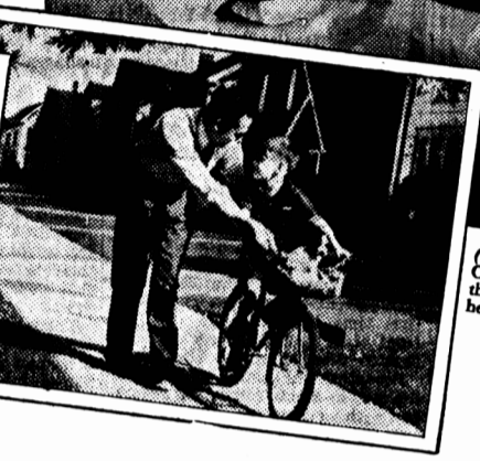
(Left) A CHIP OFF THE OLD BLOCK—did you know the old block brag when he shows the snap.