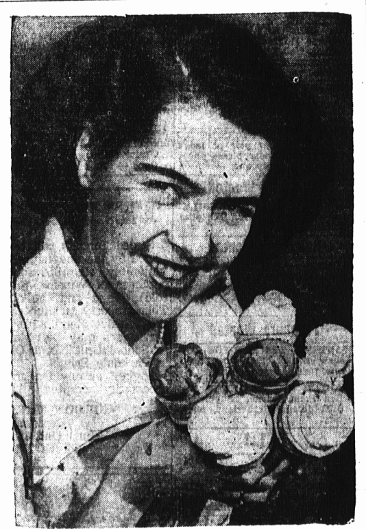
Ice cream producers in Canada have as their star salesman, Mr. Sun himself. Whenever he pushes aside the clouds for a few days, Canadians consume enough ice cream to clear the refrigerators in stores and dairies. About 7,000,000 gallons will disappear in 1952 and most of it within the next two months.