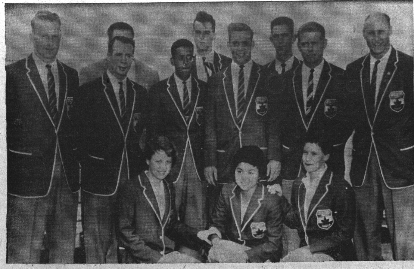
CANADIAN SILVER MEDAL WINNERS

Here are three Canadian malt extracts to satisfy every taste. Brew your own dark, light or extra light for those who like a sparkling lighter type beverage. Be sure to use Doric Yeast from Lallemand A truly Canadian Company.