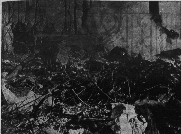
PLANE WRECKAGE WHERE 17 PERISHED Lines Viscount that crashed about 10 miles west of Ball's Bluff, Nfld., State Police at the scene said all 17 aboard, including an infant, died in the wreck.

The motion was withdrawn after Fontaine's lawyer, Claude Denis, insisted the Crown present more evidence.