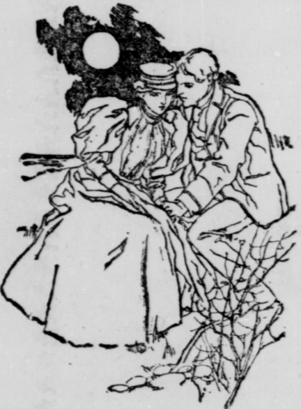
She was thoughtful for a moment.

The next morning Mme. Walcott took her departure. Señor Martillo went at the same time. He was very