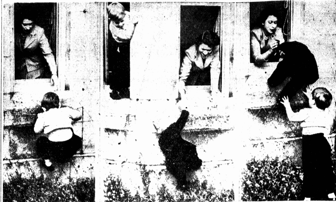
Taken at Balmoral Castle in Scotland, these unusually informal pictures find Queen Elizabeth II, Prince Charles, and Princess Anne...