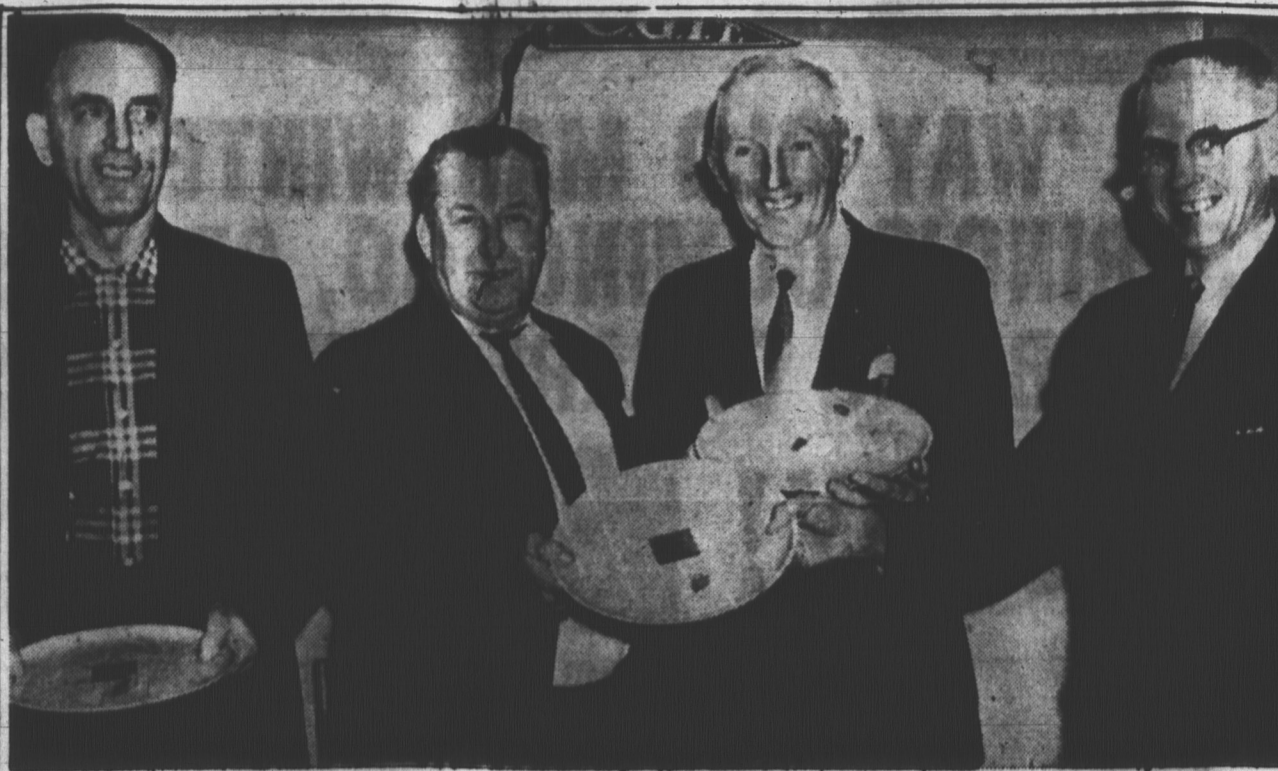
BROOKLYN TRIO IS HONORED

The world's forests yielded $38,400,000,000 worth of products in 1965.