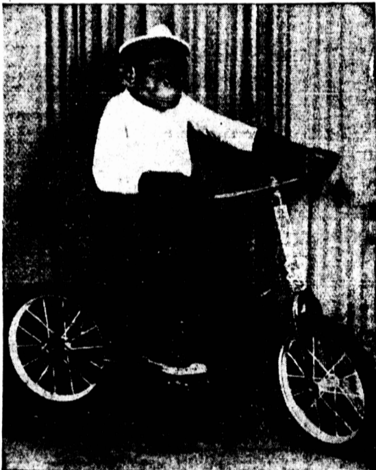
Movieland's favorite chimps