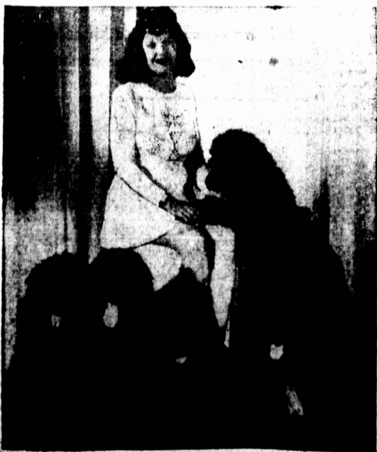
A thrilling canine show,