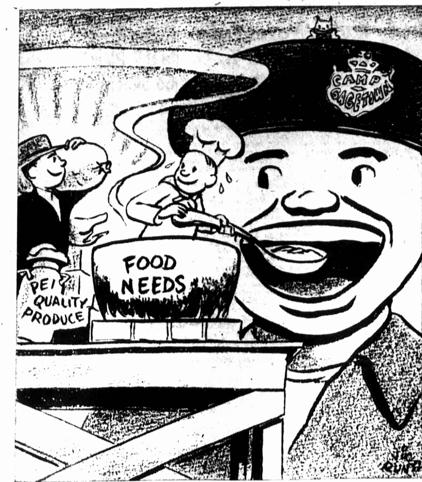
READY TO HELP FILL THE GAP