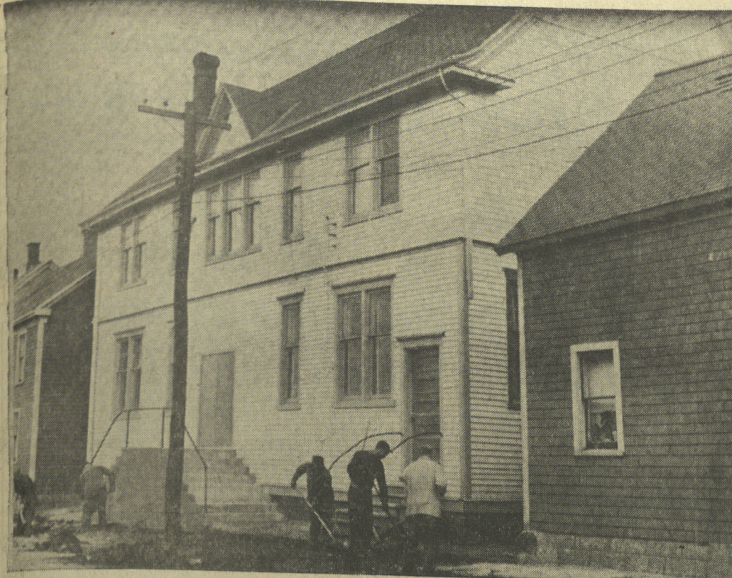
K. OF C. YOUTH CENTRE