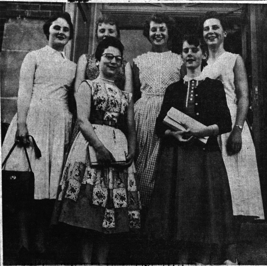
ISLAND REPRESENTATIVES AT ROYAL

LONDON (Reuters)—Dr. Geoffrey Fisher, Archbishop of Canterbury, said Friday night that no one had yet won his prize for a substitute word for Anglican.