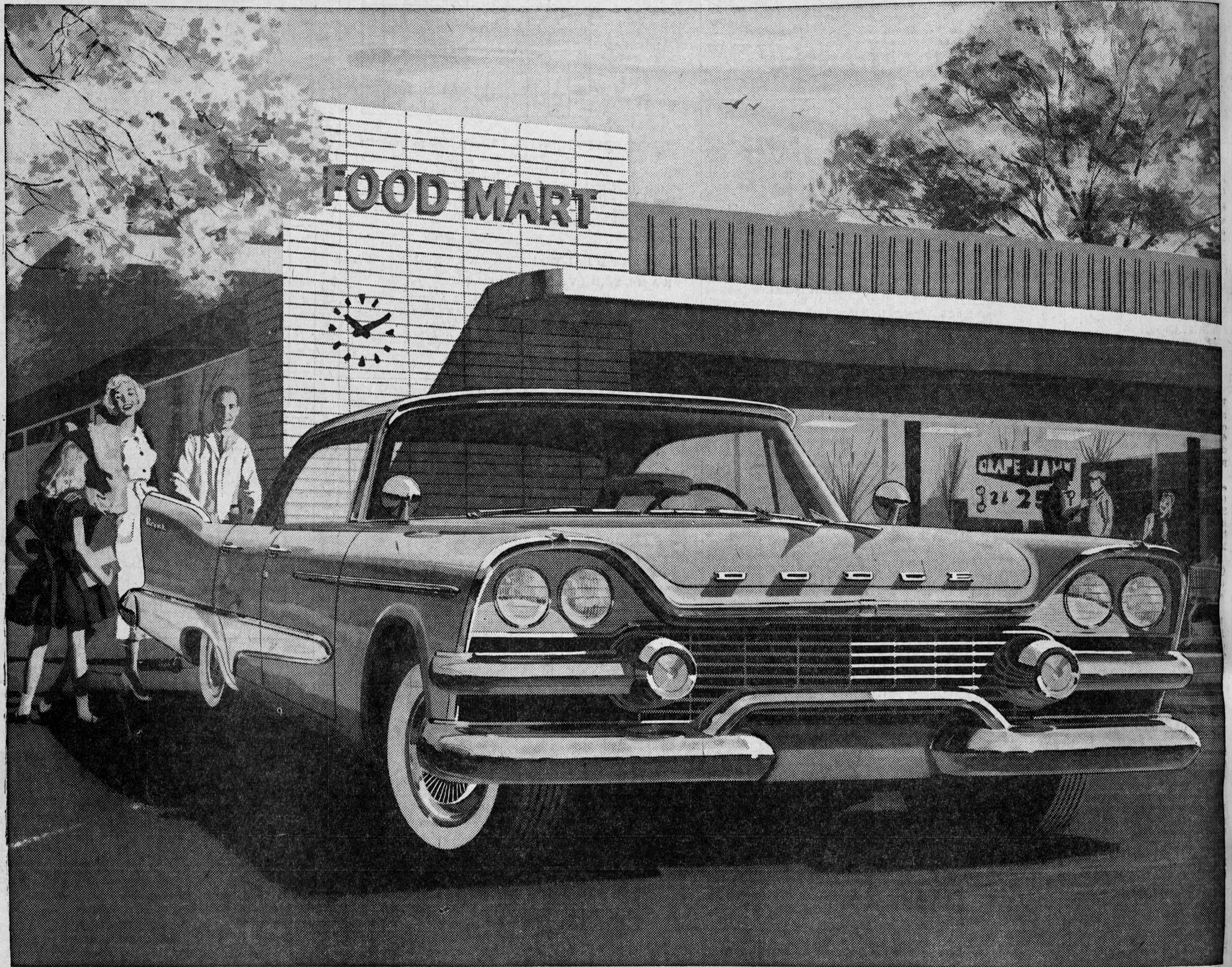
Beauty bonus! Ask us about the sparkling new glamour trim that you can have on this Dodge Regent four-door hardtop.