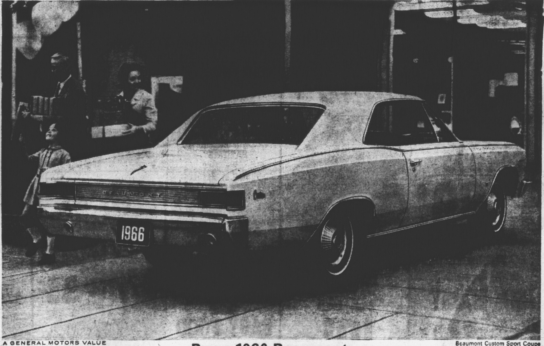
A GENERAL MOTORS VALUE