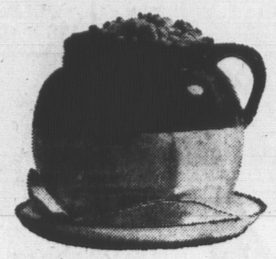
Order beans in a famous restaurant