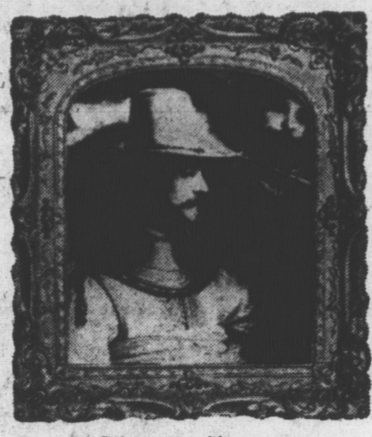
Paint a new old master