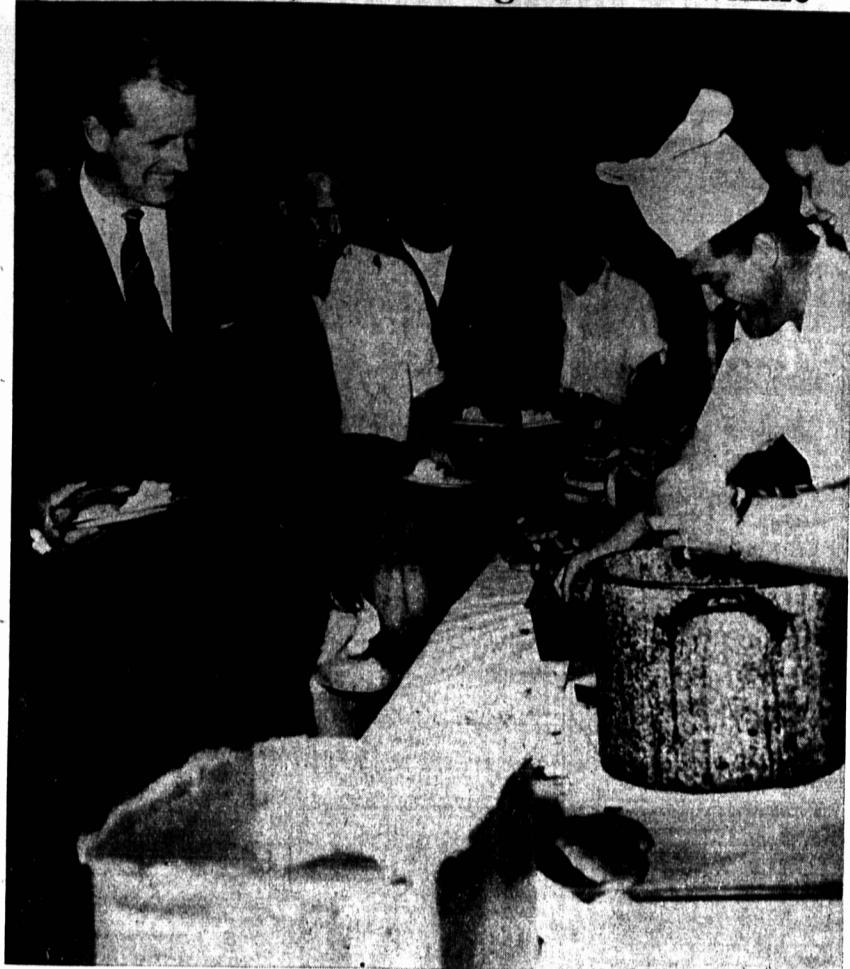
Buffalo burger was the main course at a beach barbecue given for the Duke of Edinburgh in the gold-mining town of Yellowknife, N. W. T. The duke, burger in hand, watches the chef dish out the grub in a tent.—(CP Photo).