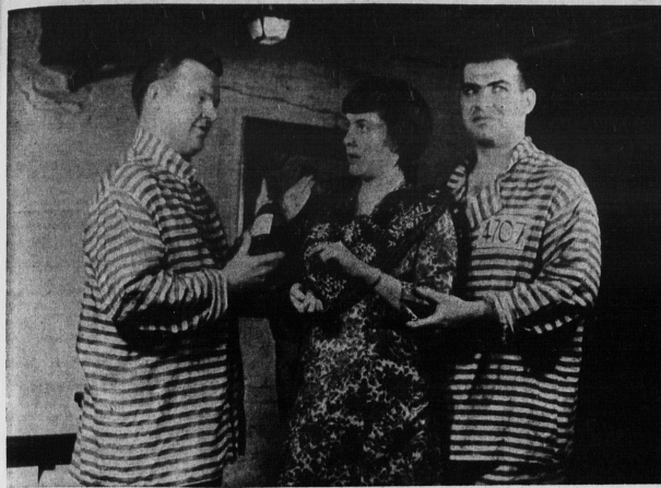
MY THREE ANGELS WILL BE PRESENTED SATURDAY BY ONTARIO GROUP