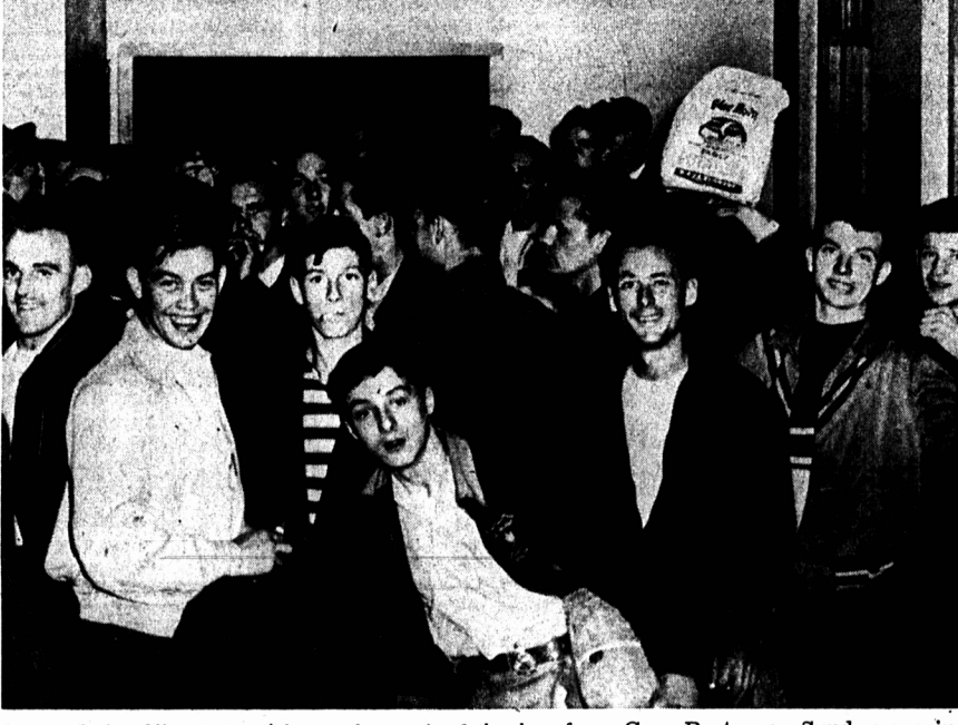
Some of the 95 potato pickers who arrived by bus from Cape Breton on Sunday evening are seen above in the National Employment Office in Summerside shortly after their arrival. Indicative of their purpose of being in this Province, one of the men holds up one of the smaller varieties of paper potato bags that he had picked up along the way.