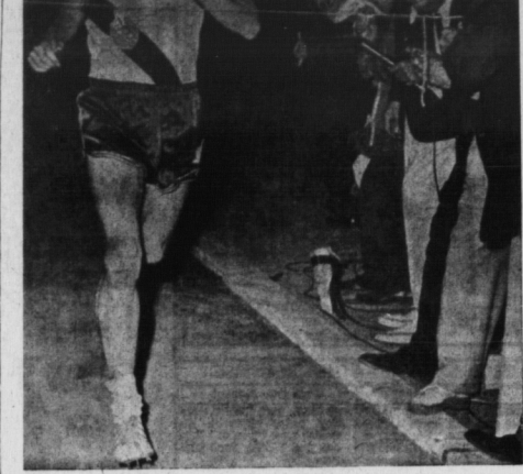
BRUCE KIDD IS WINNER

July 11: Vernon River at Fanning Brook; Fort Augustus at Johnston's River.