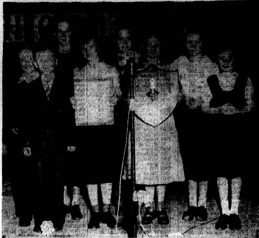
Pictured above is the Albany Rural School Chorus, winner in the Schurman's School Parade Group Singing competition for the 1-3 Classrooms. They are displaying the beautiful silver shield and framed Gold Certificate which was awarded to them on Schurman's School Parade's final program.