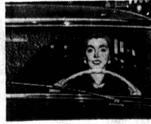
Electrically driven windshield wipers offer maximum bad-weather safety, clear more of the big Forward Look wrap-around windshield. Unlike vacuum wipers, electric wipers do not slow up when you accelerate or climb hills.