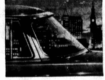
Only true wrap-around windshield. Wraps around at top and bottom to give you maximum visibility at eye level. In the cars of the Forward Look you get the best and safest front and side visibility of any windshield in the industry.