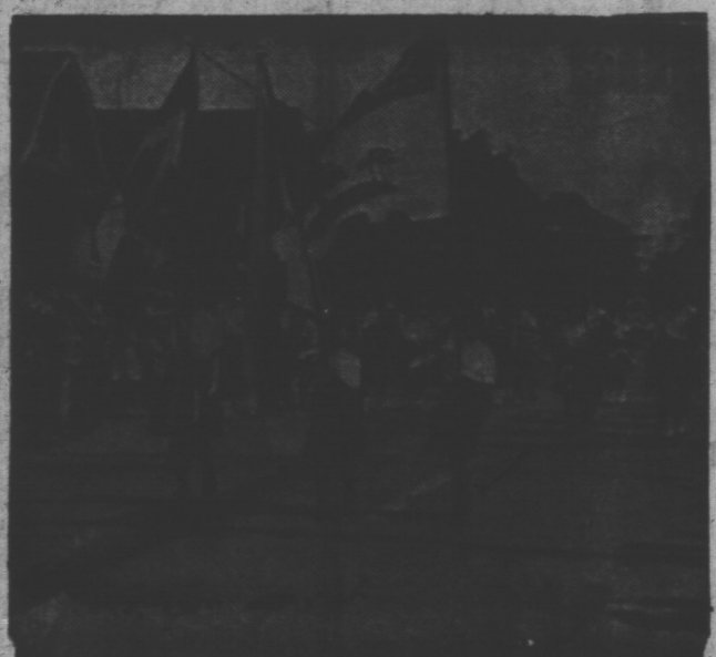
The 1966 Lobster Carnival Parade