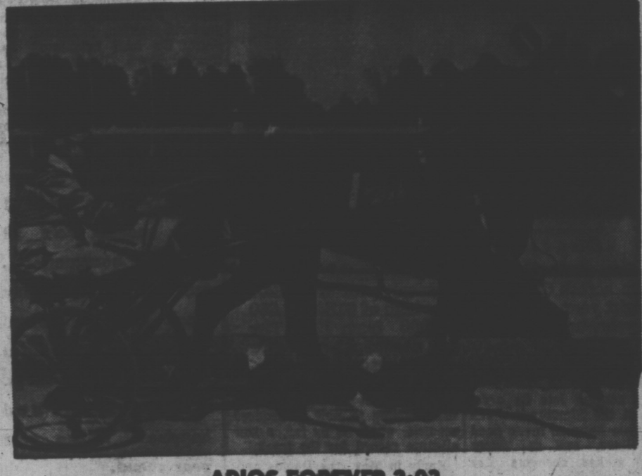
ADIOS FOREVER 2:03

TO ALL HORSEMEN and HARNESS RACING FANS! G. & G. DAIRY PARKDALE