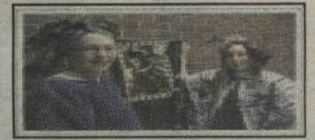
Culturama Page 16