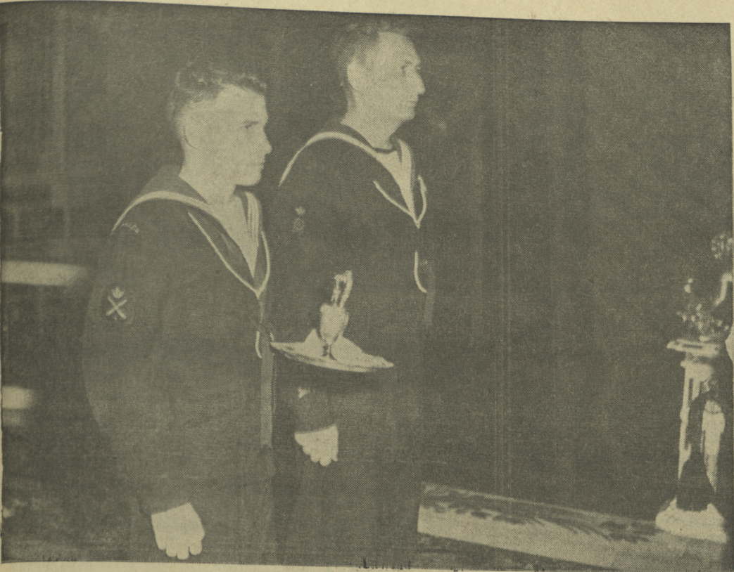
LIGHT FRIENDSHIP LAMP

A Canadian sailor recently had the honor of lighting the Canadian Lamp of Friendship at the famed monastery of Montecassino in Italy. At the tomb of