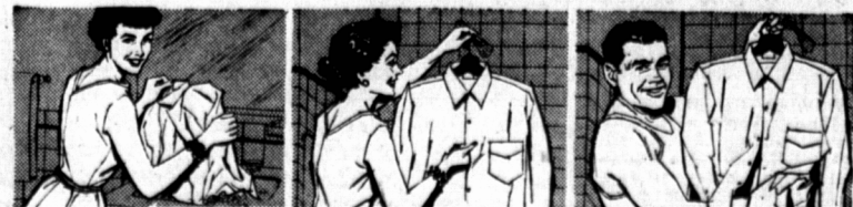
1. Rinse in mild suds. 2. Slip it on a hanger. 3. Irons itself as it dries.

And see how easy it is to launder the NEW Forsyth No-Iron shirt!