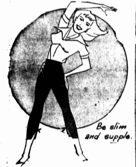
Be slim and supple.

Spring . . . Spring . . . SPRING! Let's pull out of the winter slump. At this season one's figure is apt to look soft around the edges. The waist has lost its clearly defined, snug contour, and there is likely to be a lax, girdle top roll. The lateral muscles which bound the sides of the silhouette tend to lose tone. We habitually use some muscles over and over