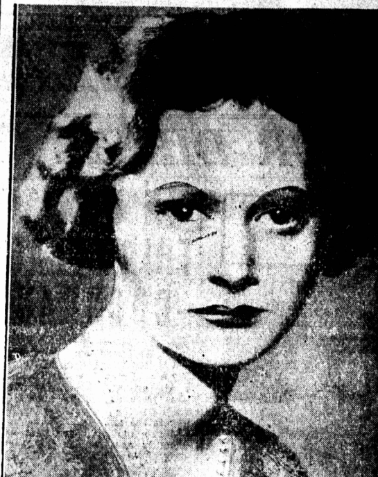
Princess Alexandrine-Louise of Denmark, third daughter of Prince Edward VIII