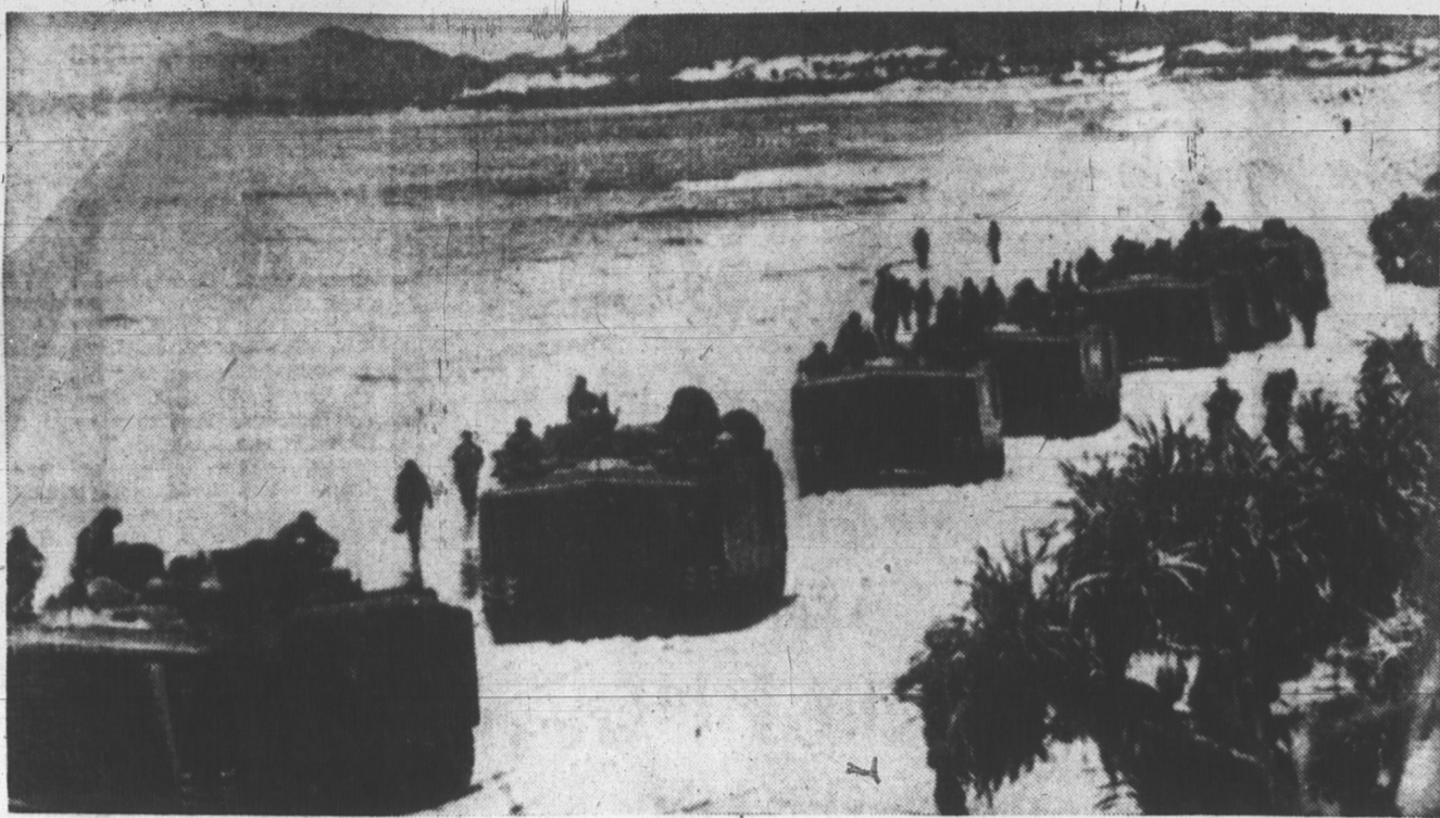
AMPHIBIOUS TRACTORS SEARCH ROUTE INLAND

A column of amphibious tractors carrying troops of the First Battalion, 26th Marines, moves along the beach near Ham Tan, east of Saigon, after combat assault from ships of the Seventh Fleet, participating in Operation the beach from the jungle and troops and to advance on foot.