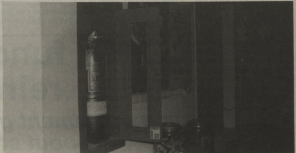
Barn aficionados should become familiar with this piece of equipment now that fire insurance has been cut.

Tran added that if the building was to be destroyed before the completion of the new Student Centre, the Student Union offices could be relocated to any available space on campus such as Alumni Gym.