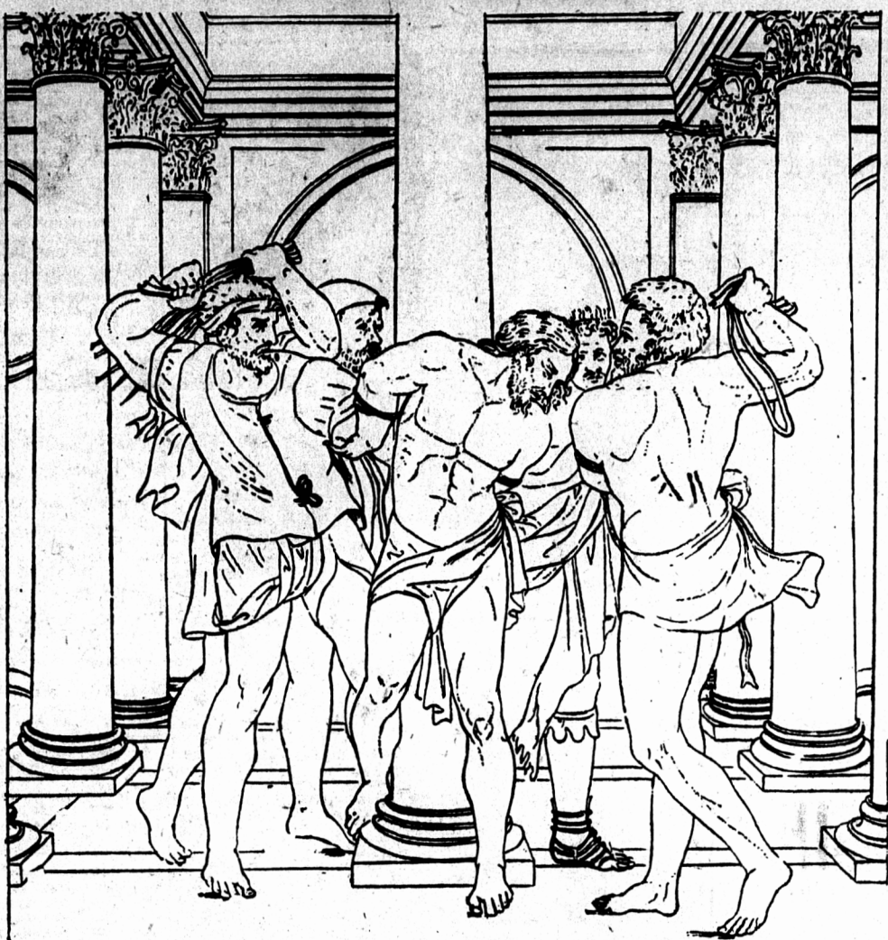
TODAY, NO. 7: CHRIST SCOURGED

As a boy, Michelangelo Buonarroti (1475-1564) wanted to do nothing except draw. Consequently, his father sent Michelangelo in his teens to an artist's studio in Florence to study. The youth's interest turned to sculpture, and it was as sculptor and painter of frescoes that Michelangelo became an immortal. He scored painting on canvas. In the course of decorating the Sistine Chapel at the Vatican with the Biblical scenes which are his greatest masterpieces, Michelangelo made many cartoons like this one which is reproduced from an engraving by S. del Piombo. It, of course, shows the scourging of Jesus, as told in St. Mark 15:15-20.