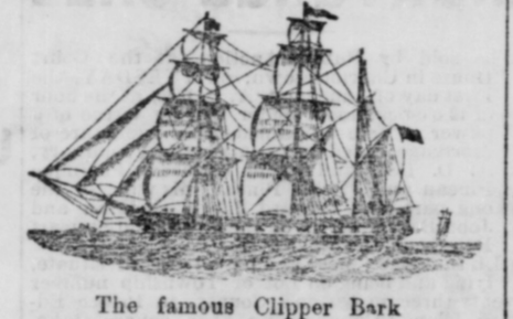
The famous Clipper Bark