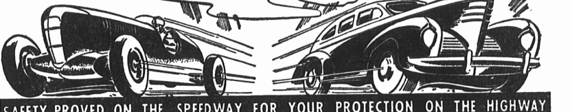
SAFETY-PROVED ON THE SPEEDWAY FOR YOUR PROTECTION ON THE HIGHWAY

This sensational new Firestone Champion Tire is everything its name implies—a champion in long mileage, safety and style. Never before could you get so much extra tire value—and at no extra cost!