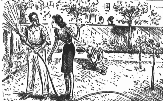
"Oh, George, Mrs. Jones has got a hat exactly the same as mine. I want you accidentally to put the hose on it." —Humorist.