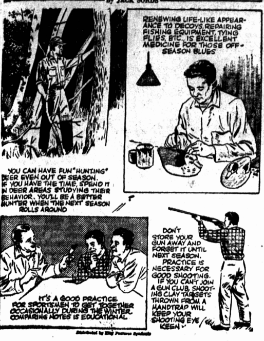
RENEWING LIFE-LIKE APPEARANCE TO DECAYS REPAIRING FISHING EQUIPMENT, TYING FLIES, ETC., IS EXCELLENT MEDICINE FOR THOSE OFF-SEASON BLUES.

"YOU CAN HAVE FUN HUNTING" BEER SWIM ON THE BEACH. IF YOU HAVE THE TIME, SPEND IT IN DESER AREAS STUDYING THEIR BEHAVIOR. YOU'LL BE A BETTER HUNTER WHEN THE NEXT SEASON ROLLS AROUND.