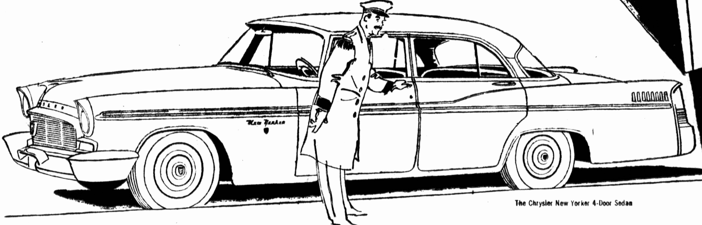
The Chrysler New Yorker 4-Door Sedan

It is one thing to flaunt affluence... to boast.