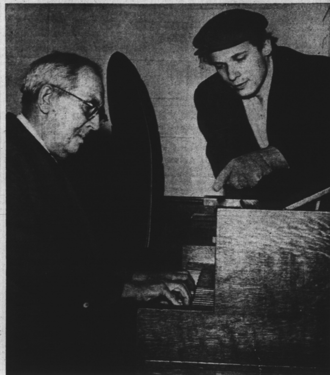
VETERAN IS SHARP