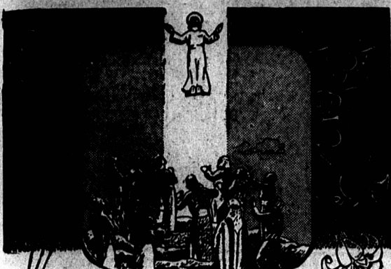
THE ASCENSION Reel No. E-13