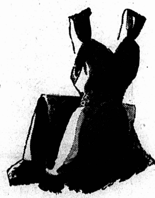
Nylon & Acetate