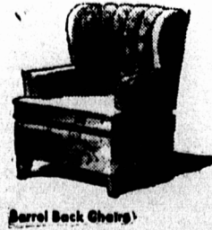
Barrel Back Chair

See the wide selection of styles, fabrics and colors in the sensational Kroehler fall line. A few typical examples shown here. Priced to fit every budget.