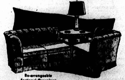
Re-arrangeable Sectional Groupings

ONLY 5.00 DOWN DELIVERS YOUR NEW KROEHLER SUITE Balance Weekly or Monthly