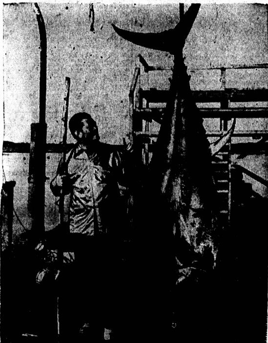
"It's the biggest fish I ever caught," said Gene Tunney, the ex-heavyweight boxing champion of the world, when he landed this 808-pound tuna recently at Wedgeport, Nova Scotia. Tunney attended the 7th International Tuna Cup match at Wedgeport as a spectator, all the while itching to get a rod in his hands and try his own luck. The day after the match, won by Chile, he boated this one.