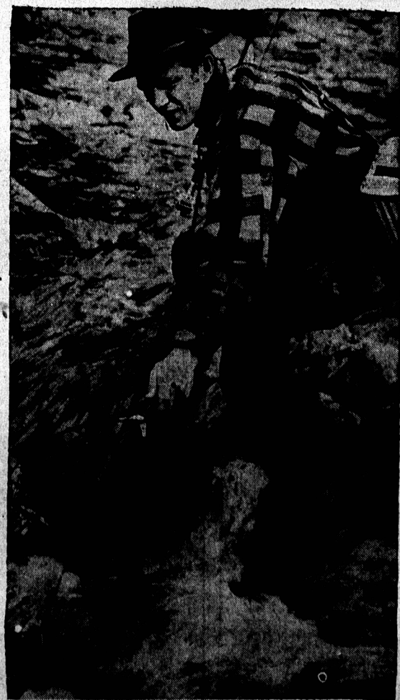
Favorite pastime of fishing which Terry Moore, movie starlet, is on her way to enjoy, has aroused controversy as to whether there has been a decline in number of fish in Algonquin Park. Because fishing has been so poor there this year, U. S. tourists, like one seen above, have threatened not to return till lakes have been restocked. In retaliation parks superintendent reported that there has been no decline. In an effort to solve the problem the Department of Game and Fisheries may be asked to construct fish hatchery in park.