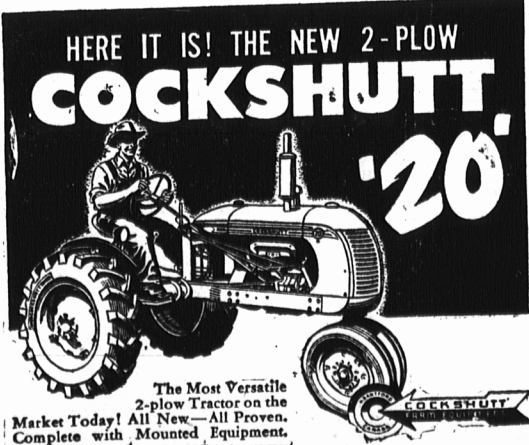
The Most Versatile 2-pow Tractor on the Market Today! All New—All Proven. Complete with Mounted Equipment.

We specialize in the sale of Farm Implements which have proved their worth in Efficiency and Economy.