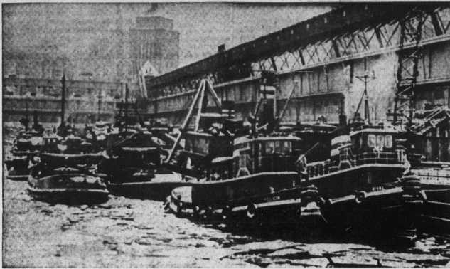
TUGS IDLE AS WINTER HITS MONTREAL

A fleet of tugs huddles up against a wharf in Montreal harbor as activity slackens for the winter freeze-up. The harbor had its second heaviest season in history this year, second only to that of 1961.