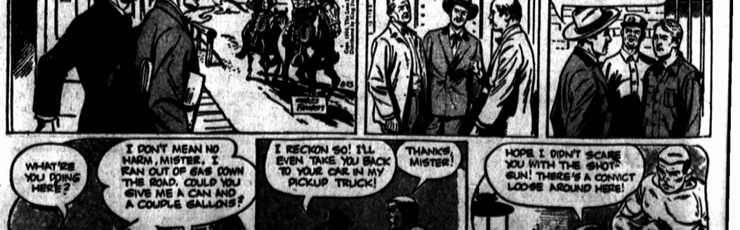
SECRET AGENT X9