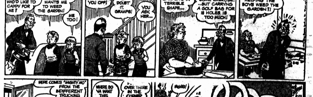
TILLY THE TOLER