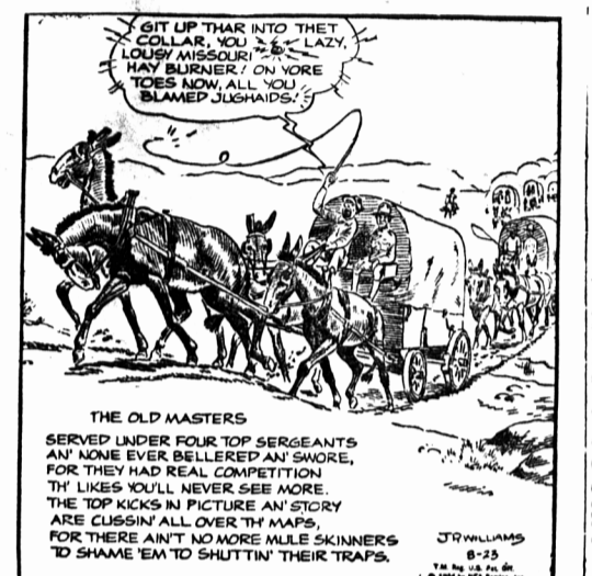
THE OLD MASTERS SERVED UNDER FOUR TOP SERGEANTS, FOR NONE EVER BELLEKED AN SWORE, FOR THEY HAD REAL COMPETITION 'TH' LIKES Y'OU' NEVER SEE MORE. THE TOP KICKS IN PICTURE AN' STORY ARE CUSSIN' ALL OVER 'TH' MAPS, FOR THERE AIN'T NO MORE MULE SKINNERS 'D SHAME 'EM 'D SHUTTIN' THEIR TRAPS.